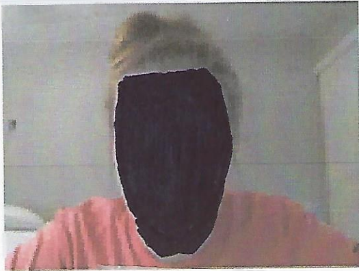
The photo you take with Respondus.

How do you do it? The students who did it held the Photo ID with their fingertips and placed it next to the WebCam and checked what they saw when they did it. See below for what I mean about the fingertips.